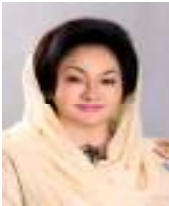
H.E. Datin Paduka Seri Rosmah Mansor First Lady of Malaysia