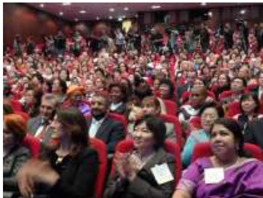
Summit Delegates at the 2011 Global Summit of Women in Istanbul, Turkey.

Under the theme of Women: The Engine of Economic Growth , the 2012 Summit will inform delegates on how to access Europe's changing market, showcase women business and government leaders from the region, provide skills-building sessions for, as well as establish networks among, such leaders. For 22 years, the Global Summit of Women has been enabling women leaders to grow their businesses, expand their networks, enlarge their opportunities in their countries, regions, and globally. Join us at the Summit to share lessons for improving the lives of women everywhere.