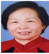
Hon. Nguyen Thi Doan Vice President, Vietnam