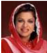
Hon. Shahrizat Abdul Jalil Minister of Women and Community Development, Malaysia